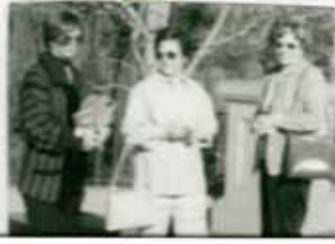
Lon Aunt Kinder Aunt